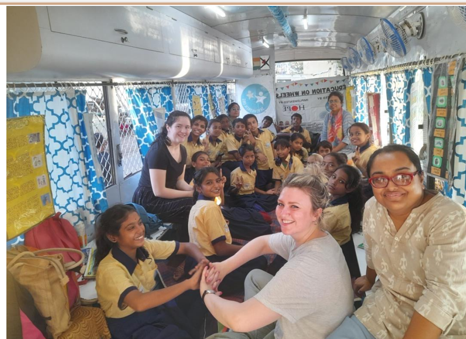
International Volunteers interacted with the children of the Education on Wheels project in Chitpur as a part of the orientation visit.