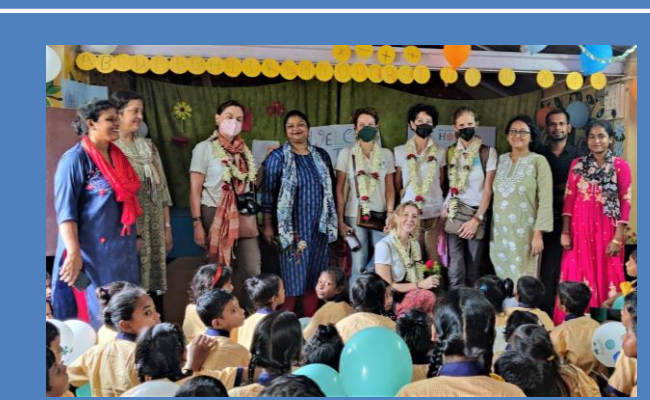
On 24th March 2023, Sky Children Onlus Team inaugurated the 8th Naboasha education centre in Sick line for the slum and street connected children