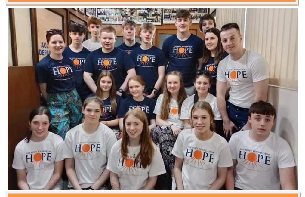
Students from Rockwell College of Ireland raised funds for the HOPE and visited many HOPE projects including the HOPE Hospital.