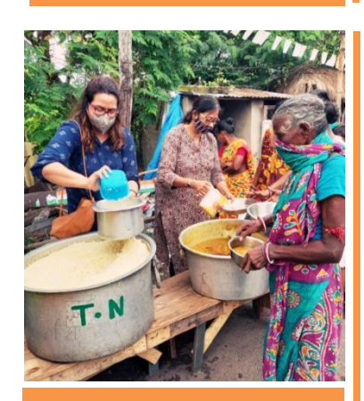
Hope Staff distributing cooked food in community

Please visit www.hkf.ind.in /www.hopechild.org and contribute online